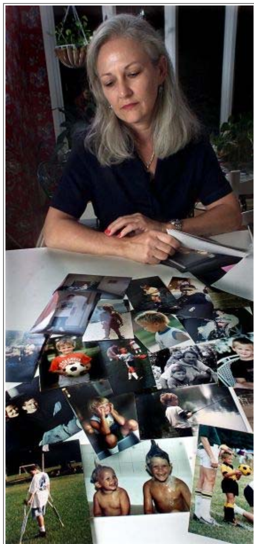
UNIMAGINABLE GRIEF: Many parents must bear the weight of their children dying prematurely. Above, a mother suffers the loss of her son, who succumbed to cancer.

Now read Ecclesiastes 9: “For to him that is joined to all the living there is hope: for a living dog is better than a dead lion. For the living know that they shall die: but the dead know not any thing , neither have they any more a reward; for the memory of them is forgotten” (vs. 4-5). Again, the Bible is clear about the state of the dead.