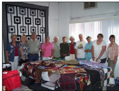
Hospice Volunteers at Maricopa Quilt Company in Maricopa